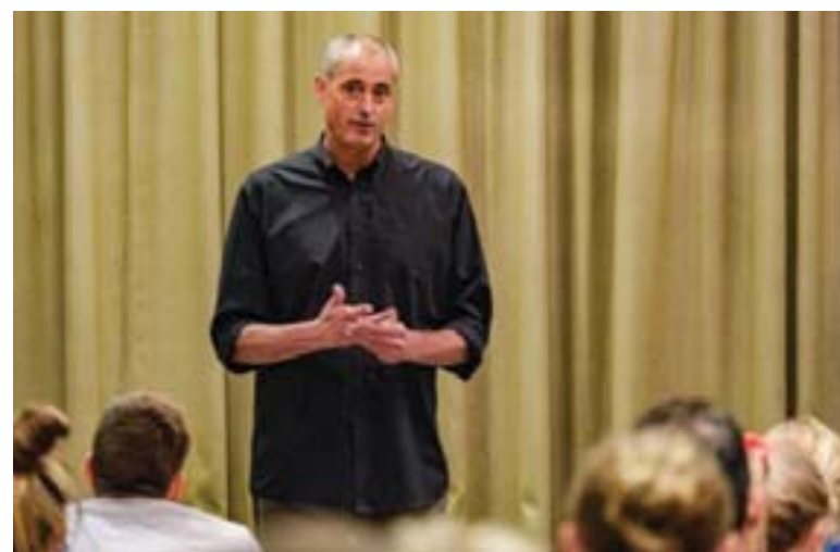
Biondi speaks to the members of the International Swimmers Alliance in Budapest.